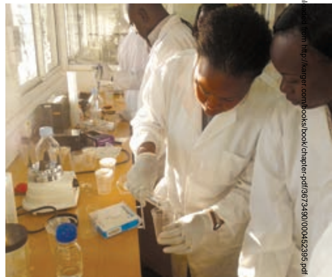
Sample preparation at the mycotoxin platform of Beca-ILRI, Kenya.

Aflatoxins also affect the volume and value of agricultural output, and can directly impact food and nutrition security. For instance, about 10% of the 2010 Kenyan maize harvest was withdrawn from the food supply in a responsible move taken by the Kenyan government to protect public health.