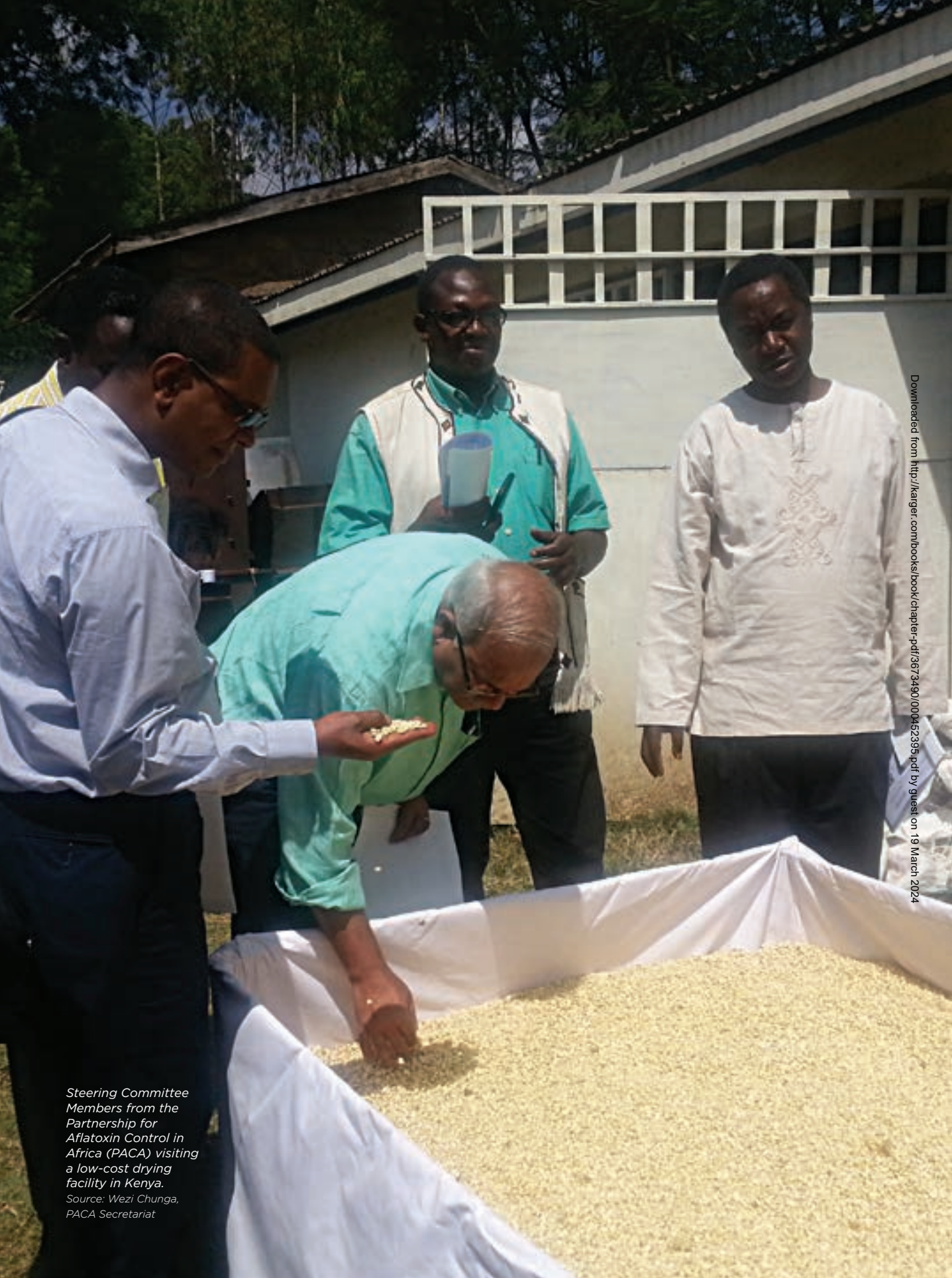
Steering Committee Members from the Partnership for Aflatoxin Control in Africa (PACA) visiting a low-cost drying facility in Kenya.