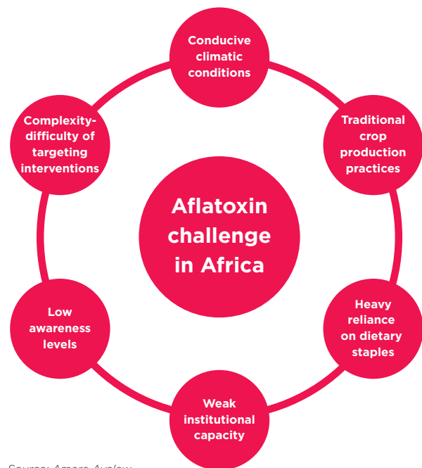
Figure 3 | Factors contributing to the serious aflatoxin problem in Africa

Aflatoxins are a worldwide problem because of the global movement of affected produce. However, the challenge is more serious in Africa, and the burden on smallholder farmers far more pressing, for a number of reasons (Figure 4). First, prevalence of the toxin is higher in Africa and South East Asia. Second, subsistence farmers cannot afford to diversify their diet and are often heavily dependent on high-aflatoxin-risk staple crops such as maize and groundnuts. They consume 70% of what they produce, selling the better-quality produce to generate income. Third, weak policy and organizational support, coupled with limited awareness of the importance of aflatoxin control to public health, aggravate the problem – more so in the case of smallholder farmers.