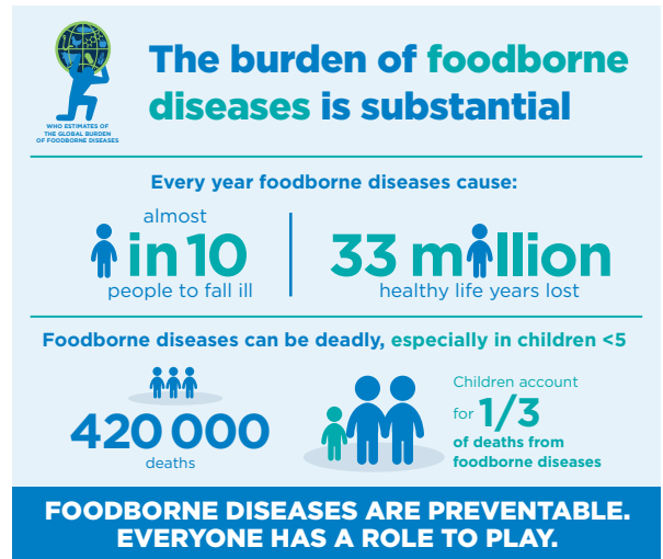
Figure 1 | WHO Estimates of the global burden of foodborne diseases. 2015