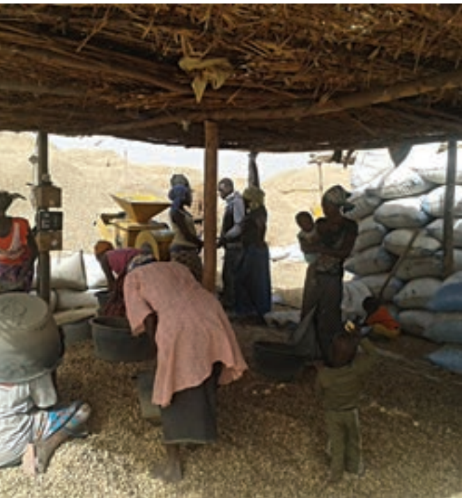
Women shelling groundnuts in Senegal, a PACA partner country. The women and their children are fully exposed to the dust emanating from the groundnut shells, which is laden with fungal spores containing aflatoxins. A bowl and a bag are being used as protective head-coverings.

The lack of consistency in aflatoxin standards among countries hampers export. Countries are likely to trade with each other if they have similar sanitary and phytosanitary standards (SPS). Moreover, developing countries with weak SPS capacities find it difficult to meet the diverse standards of importing countries. Investment by developing countries in strengthening SPS capacities, and in particular, food safety capacities, needs to be commensurate with the cost of weak capacities in these areas. The costs are: exclusion from export markets with associated lost opportunity for economic development and unacceptably high dietary exposure of local consumers to mycotoxins. Preliminary studies commissioned by the Partnership for Aflatoxin Control in Africa (PACA) reported Disability Adjusted Life Years (DALYs) ranging from 93,639 in the Gambia to 546,000 in Tanzania, with US$94 million to be saved in the Gambia alone if efforts were to be made to reduce aflatoxin exposure.